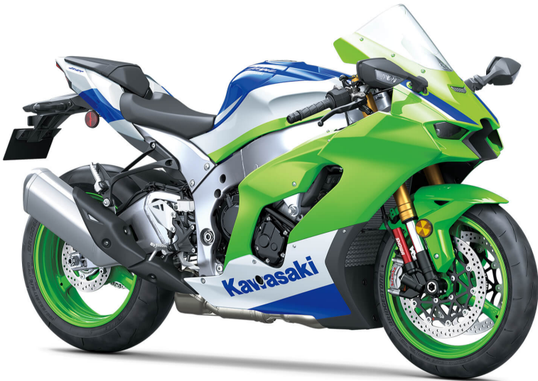
LIME GREEN/PEARL CRYSTAL WHITE/BLUE